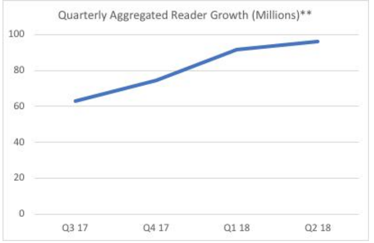
** source: Google Analytics, sum of individual companies unique visitors

The three companies have been engaged in detailed integration planning and joint go-to-market activities since April 2018. After completion of the acquisitions, Maven, Say Media and HubPages immediately will begin operating as a single business, with consolidated financials, and a single team go-to-market effort to leverage the combined scale to drive revenue growth. Maven anticipates closing both acquisitions in the third quarter of 2018, and expects to be reporting on a consolidated basis for the month of September, 2018.